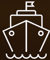
Shipping logistics and support