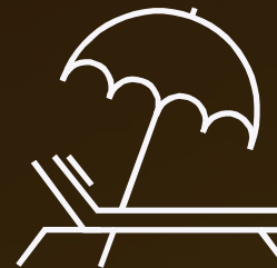
Leisure and lifestyle enhancement