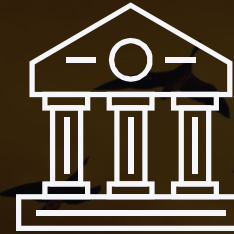
Offshore banking and financial services