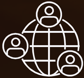
Regional sourcing and buying