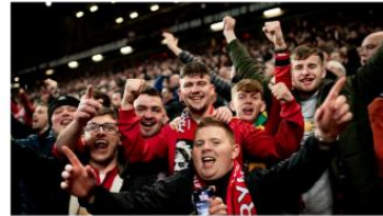
The Premier League is said to be increasingly confident that a digital passport system could be used to allow socially-distanced crowds to attend games next season.