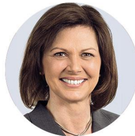
Ilse Aigner, MdL

Ambassador of the Republic of India Patron, German-Indian Business Forum