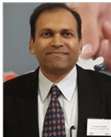
SUGANDH RAJARAM Consul General of India, Munich