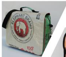
Shoulder Bikebag With hook