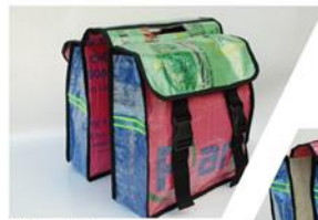
Bikebag double Economy