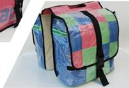
Bikebag double Large