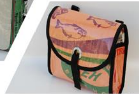
Bike bag Handle bar pouch