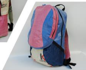
Backpack Casual Large