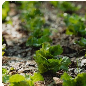
Environmental protection through sustainable farming