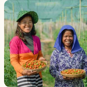
Supporting women in agriculture