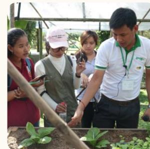
Organic Awareness Day