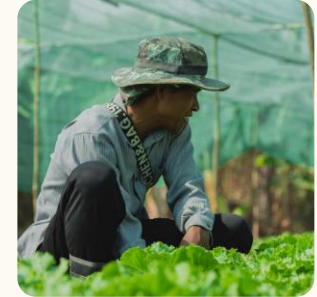
Supporting local farmers to improve their livelihoods