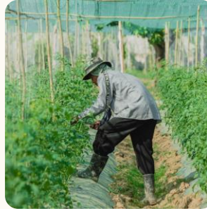
Supporting smallholder farmer communities